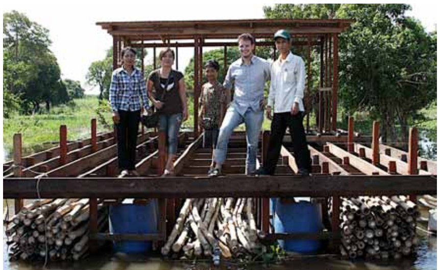
The project team with the Community Waste Management Station, a floating waste treatment barge, under construction.

For more information about EWB or to volunteer go to www.ewb.org.au