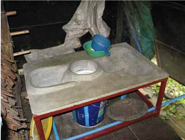
An installed floating toilet.